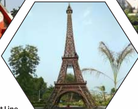
Waste to Wonder