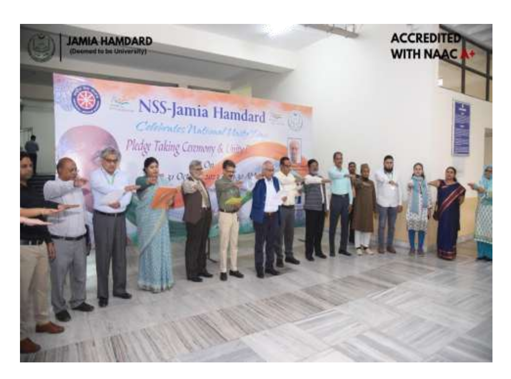
National Unity Day - 2024