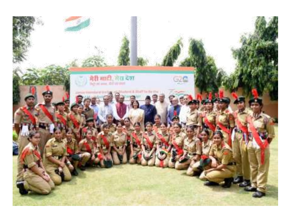
NSS Team with Vice Chancellor