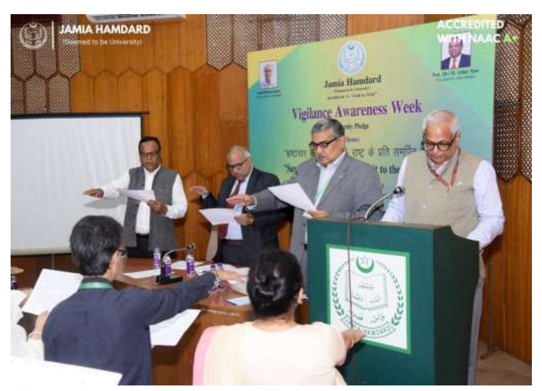
Vigilance Awareness Week