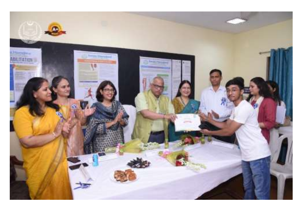
Event organized by School of Nursing and Allied Health