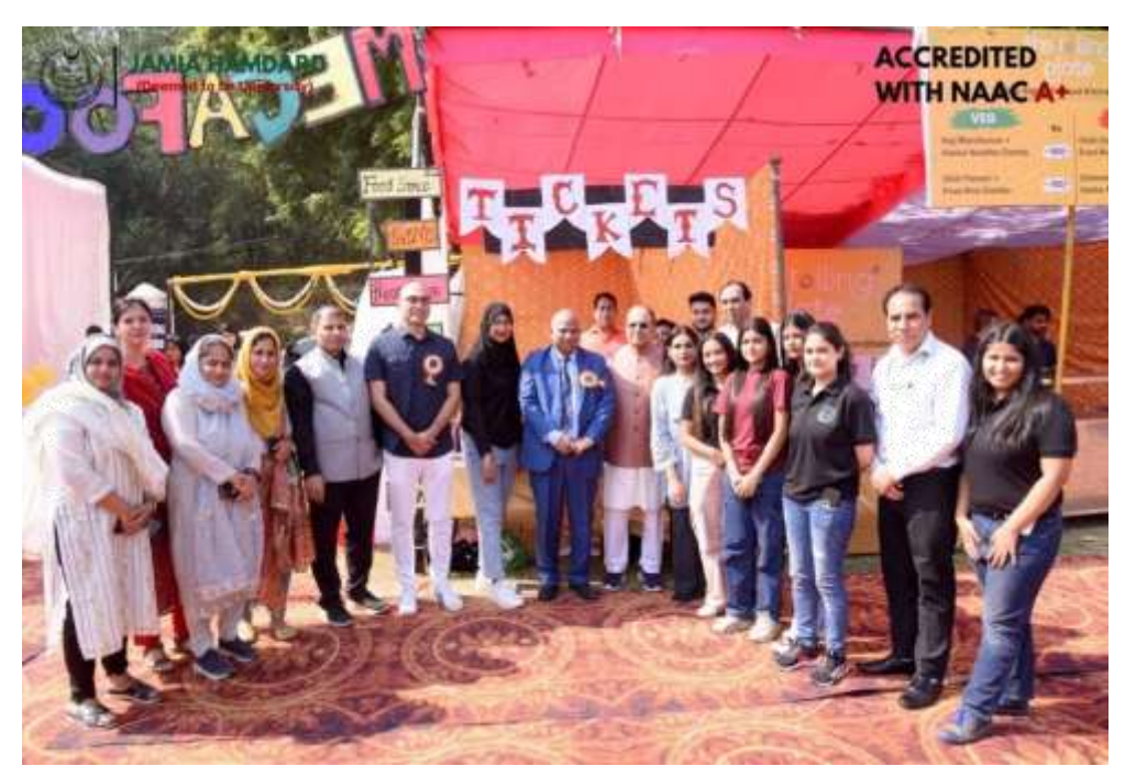
Food Mela – 2024