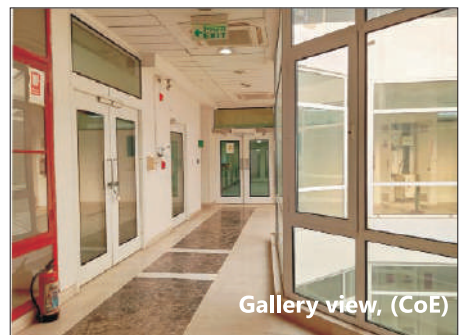
Gallery view, (CoE)