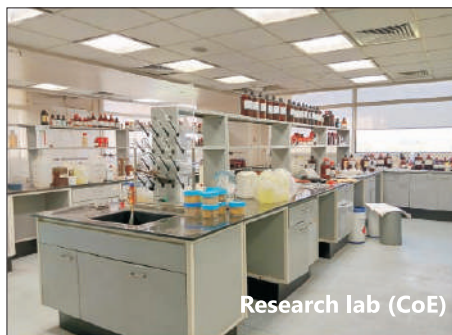
Research lab (CoE)